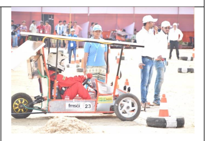
Acceleration test at ESVC – ISIE