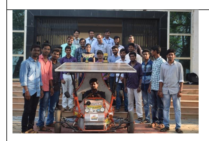
Electric Solar Vehicle