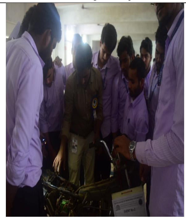
Bike Chassis Explanation