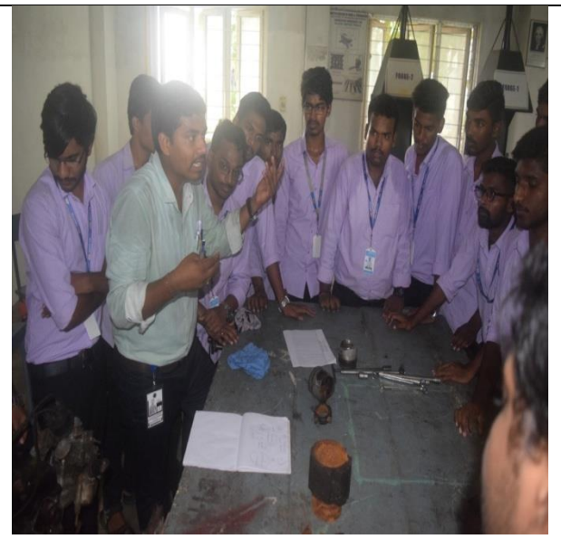
Two-wheeler Engine Components