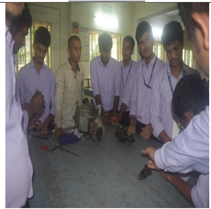
Assembly of Engine Components